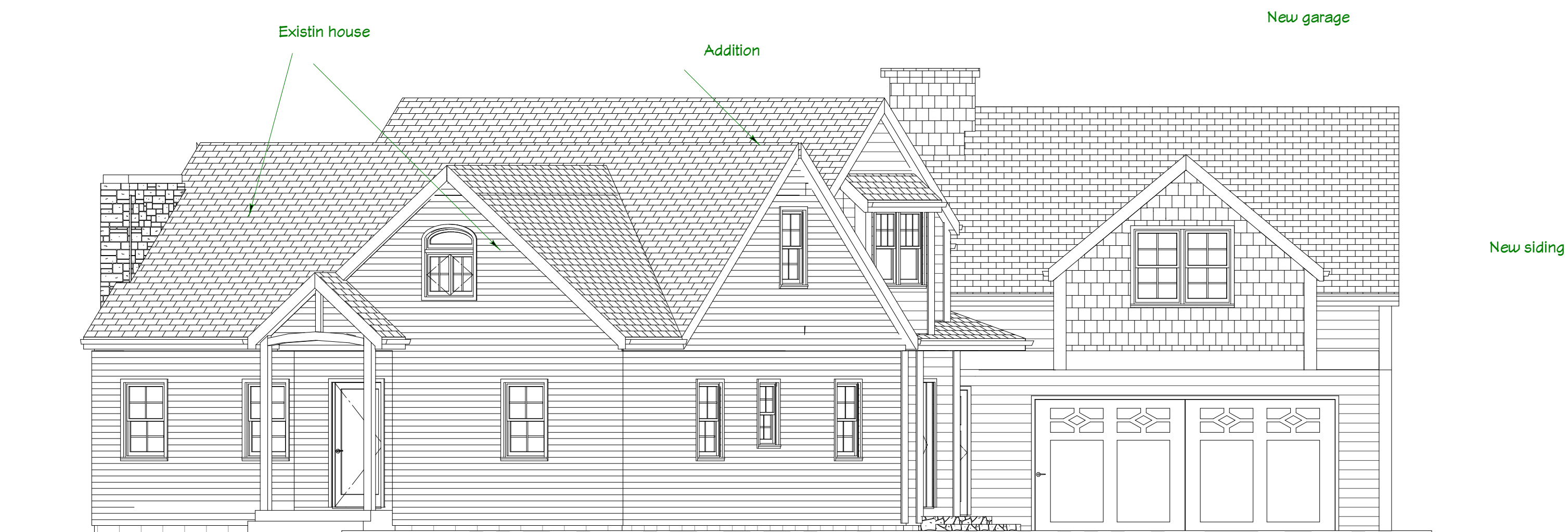
North/West elevation scale 3/16"= 1'0" 1 6