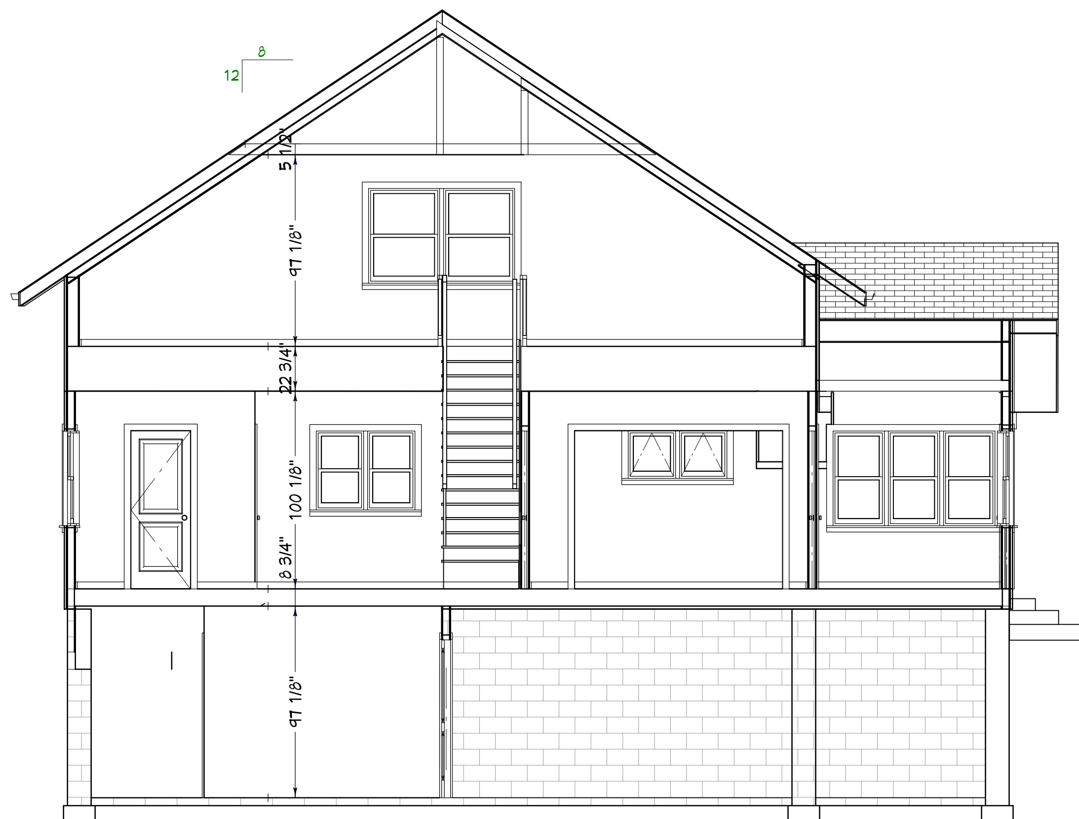
Cross section 1 Scale 1/4"=1'0" 1 6

Project No: 511.09 Issue Date: 08.20.09 Revised: Revised: